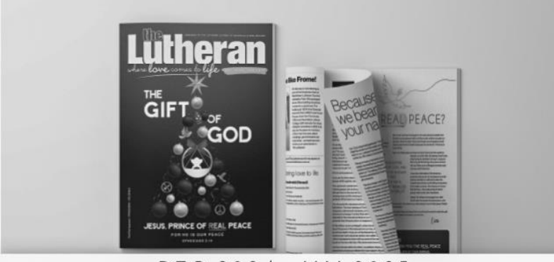
DEC 2024 - JAN 2025

We love to share stories of faith and hope from our LCAQD congregations and other agencies. Can you please help us by alerting us to relevant Facebook posts or emailing stories and photos/videos for sharing to communications@gld.lca.org.au?