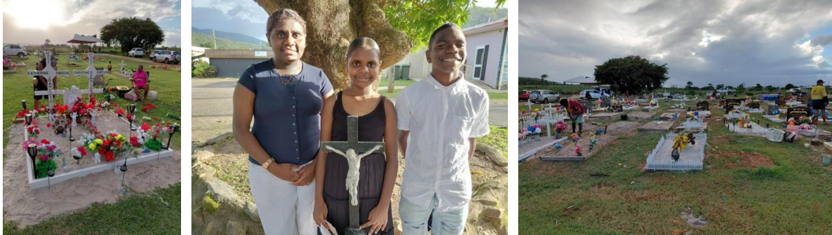
From left to right; A grave prepared for Easter Sunday Dawn Service, in Hopevale; 3 young people who wish to be confirmed along with their parents in Wujal Wujal; Hope Vale cemetery.

This indicates a positive approach from the 'church', and that we remain an important part of the lives of many people in these smaller towns in NQ. With regular every Sunday attendance not the 'norm' these days many do still recognise the role of the church.